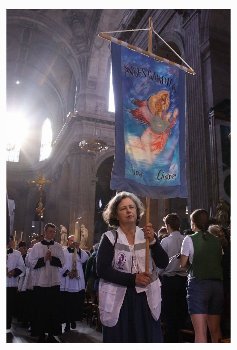
The banner of the Guardian Angels pilgrims leads the way during processions. It is placed near the altar during the pilgrimage Masses.